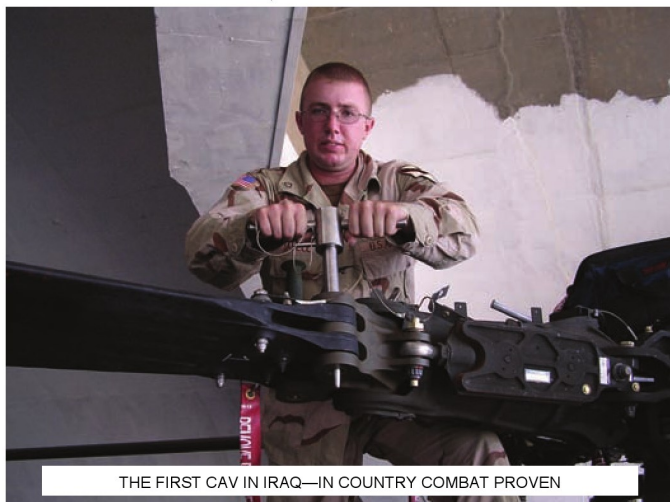
THE FIRST CAV IN IRAQ—IN COUNTRY COMBAT PROVEN