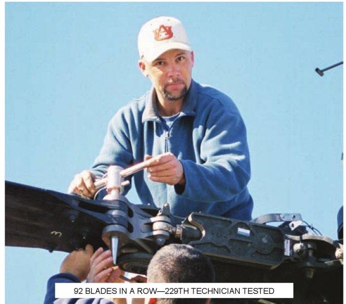
92 BLADES IN A ROW—229TH TECHNICIAN TESTED