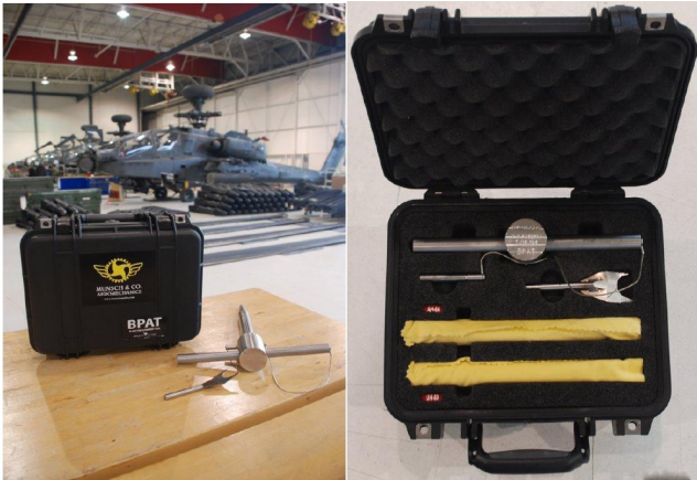
AH-64/UH-60 BPAT Kit in Custom Pelican 1400 Case 100% American Made